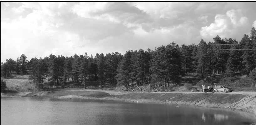
The results of all that hard work. Over 6000 square feet of the lakeside soil amended and seed sown.