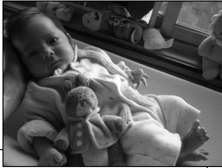
Madison at 8 weeks old